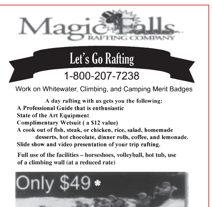
*$49 per person on Kennebec River; $59 per person on Penobscot River www.magicfalls.com